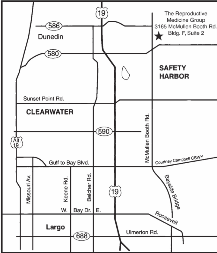
North Tampa: (813) 914-7304